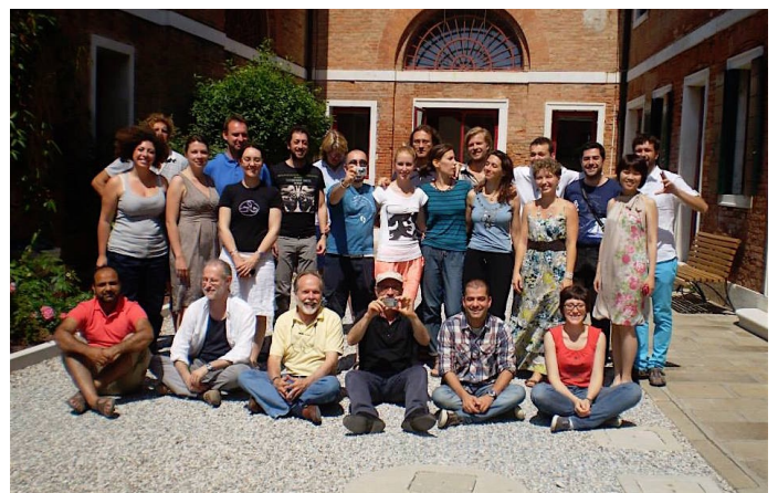
Photos from the 2 nd International School on Emergy Accounting.